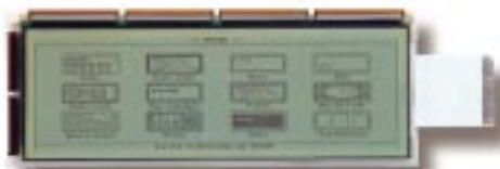
* Photograph of the monitor is its image

Winner of the "Commendation from the Chair-man of the Energy Conservation Center" at 7th "Energy Conservation Vanguard 21" in 1996